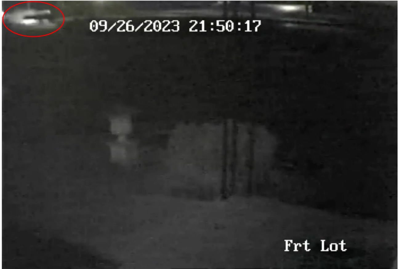
Figure 2- Luis Leyba-Gonzalez enters intersection. Collision occurs.