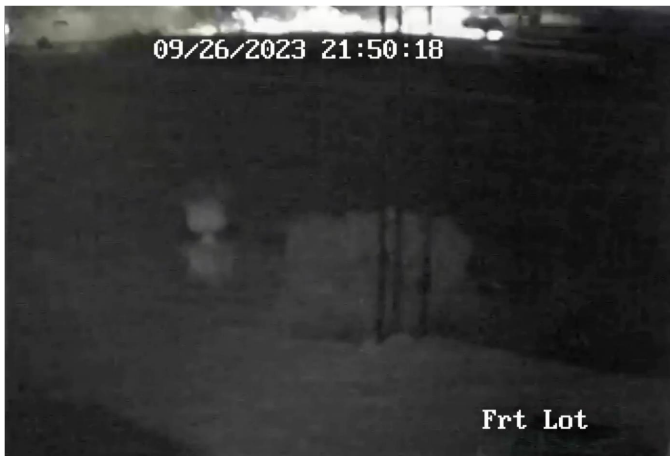
Figure 3- Force of collision sends both vehicles westbound on 10th Street.

Next, to confirm the time of the business' security footage, I checked the time stamps of the ISP dashcam. According to Trp. Munns' dashcam footage, he informed dispatch he was terminating the pursuit at approximately 21:50:05. Trp. Munn stated the fleeing vehicle was last observed traveling westbound on E 10 th Street. The emergency lights of Trp. Munns' vehicle were deactivated at 21:50:11, and Trp. Munn stopped at the lighted traffic signal at the intersection of German Church and E 10 th Street. Reviewing radio traffic, Trp. Munn can be heard contacting an ISP K9 officer and requesting to meet at Luis Leyba-Gonzalez's registered address on E 17 th Street (Image below).