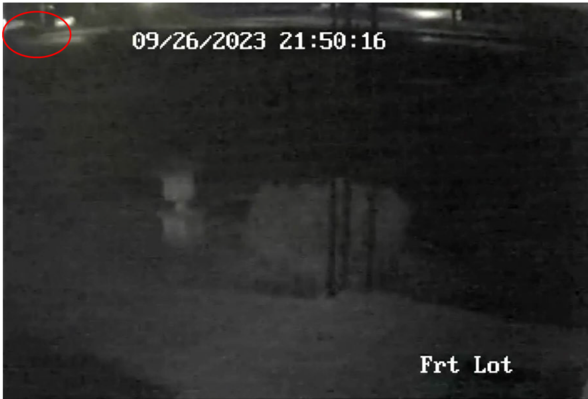
Figure 1- Hankins enters intersection, traveling southbound.