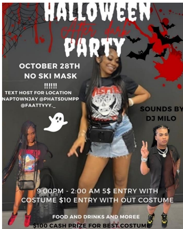
Flyer for Halloween Party posted on Naptownjay's Instagram Story on October 28, 2023

On October 28, 2023, at 9:35 pm, Helm posted the below flyer to the Naptownjay story with the caption, "SECURITY ENFORCED @djmiilo_317 🔪🔥🔥HUGE UPDATE 🍊🍊,,YALL POP OUT TO OUR SHIT ONNA FLOOR TOMORROW 🗄️🗄️🗄️ DOORS OPEN @9,, AND YESSS @_breeskitchen WILL STILL BE THERE EVERTHING THE SAME SO MAKE SURE YOUR THERE 🍊".