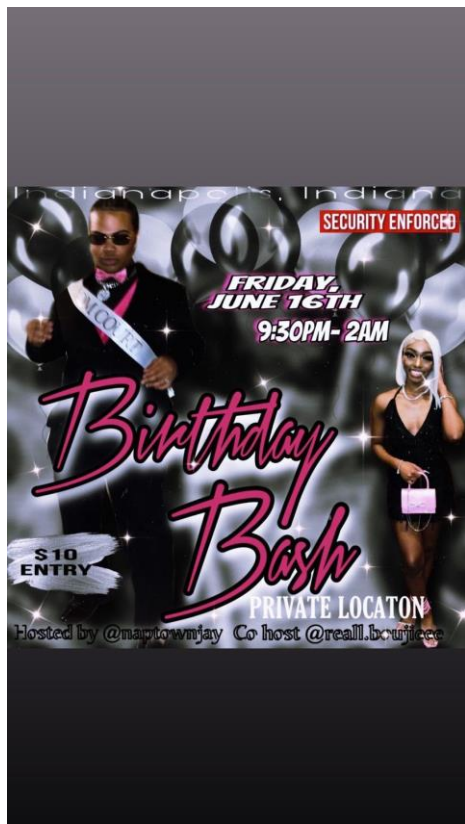
Flyer for Naptown Jays Birthday Bash on June 16, 2023