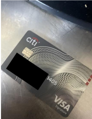
Photograph of card ending in 1405 captured on Helm's phone.

The card information stolen by Jalen Helm was used to make unauthorized purchases. Some of those purchases were conducted by Helm himself, and others by individuals he sold the stolen card information to. Emails recovered from Helm's phone show receipts for five separate purchases, one from Taco Bell and four from Texas Roadhouse, totaling $834.24 using a Visa card ending in x-1405. A photograph taken of a bank card on 10/08/2023, approximately one to two weeks prior to the purchases, shows a Visa card with the last four digits of 1405. This pattern of theft and fraud resulted in financial gain for Helm, and in part was used to finance or purchase items for his promoted parties. In total, identifying information for over 114 individuals including full card numbers serviced by 35 financial institutions were located on Helm's phone.