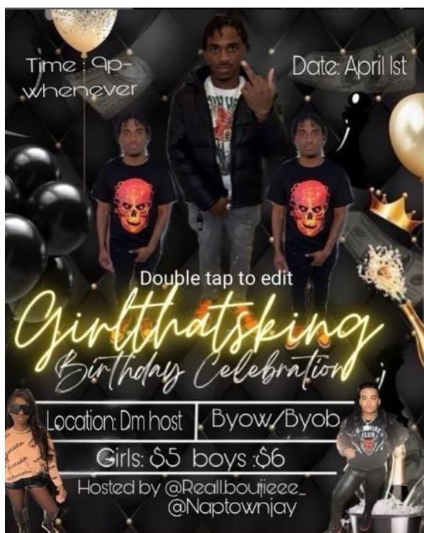
Flyer for Girlthatsking Birthday Celebration on April 1, 2023