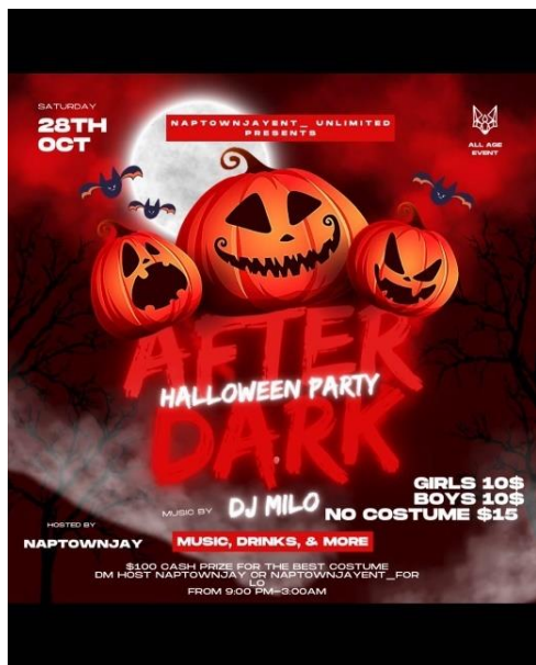
Flyer for Halloween Party on October 28, 2024

On October 15, 2023, at 4:35 pm, Helm posted the same flyer to the Naptownjay story captioned, ”@wuv.cam 🍊🍊 „UPDATE !!! „, less then two weeks left 🙄🙄🙄 @djmiilo_317”.