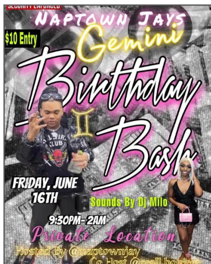
Flyer for Naptown Jays Gemini Birthday Bash on June 16, 2023

up1dracoo (Instagram: 52189781751): ay can I pay yu on cashapp ahead of time ?? naptownjay (Instagram 4310994229): Only at the door