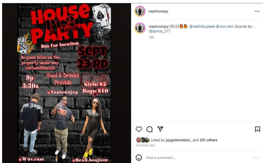
Flyer for HouseParty Pt. 2 on September 23, 2023

Helm’s CashApp indicated incoming payments of five-dollar increments started at 5:00 pm and continued through 6:30 pm. Helm received forty-eight payments totaling $506 to his CashApp account and paid D.P. $100.00 from this account.