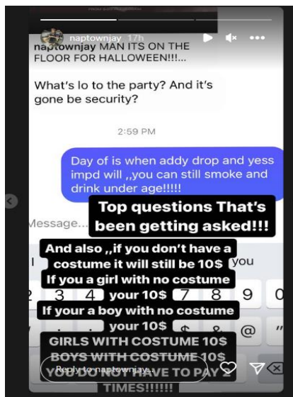
Screenshot posted to Naptownjay's Instagram story on October 26, 2023

On October 26, 2023, at 2:09 pm, Helm posted a flyer advertising a menu to the Naptownjay story including the sale of jello shots for $3. On October 26, 2023, Helm also posted the below screenshot reference security and underage consumption, specifically smoking and drinking. This was posted to the Naptownjay story.